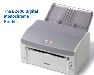
The B2400 Digital Monochrome Printer